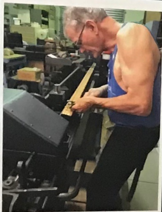
7 The master piano string maker preparing to spin and make the Bosendorfer grand pianos strings. The strings at the lower end of the piano weigh almost one kilo! In. The string is made from a steel core with an outer layer of copper wire spun onto the steel.